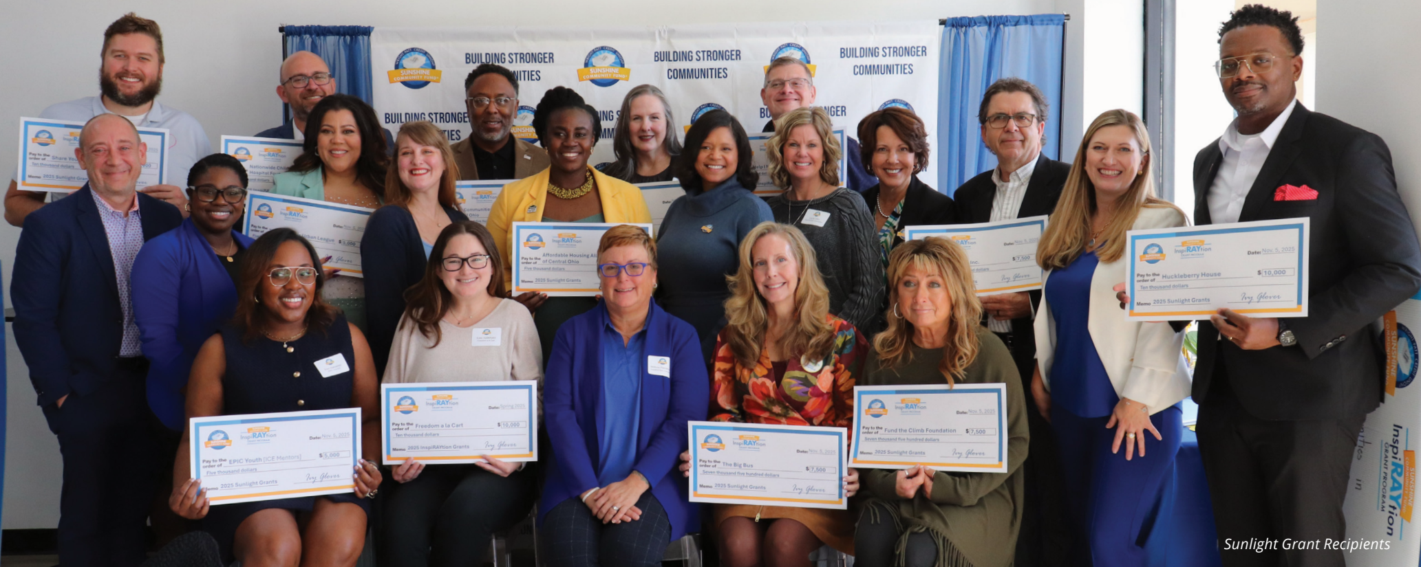
Sunlight Grant Recipients