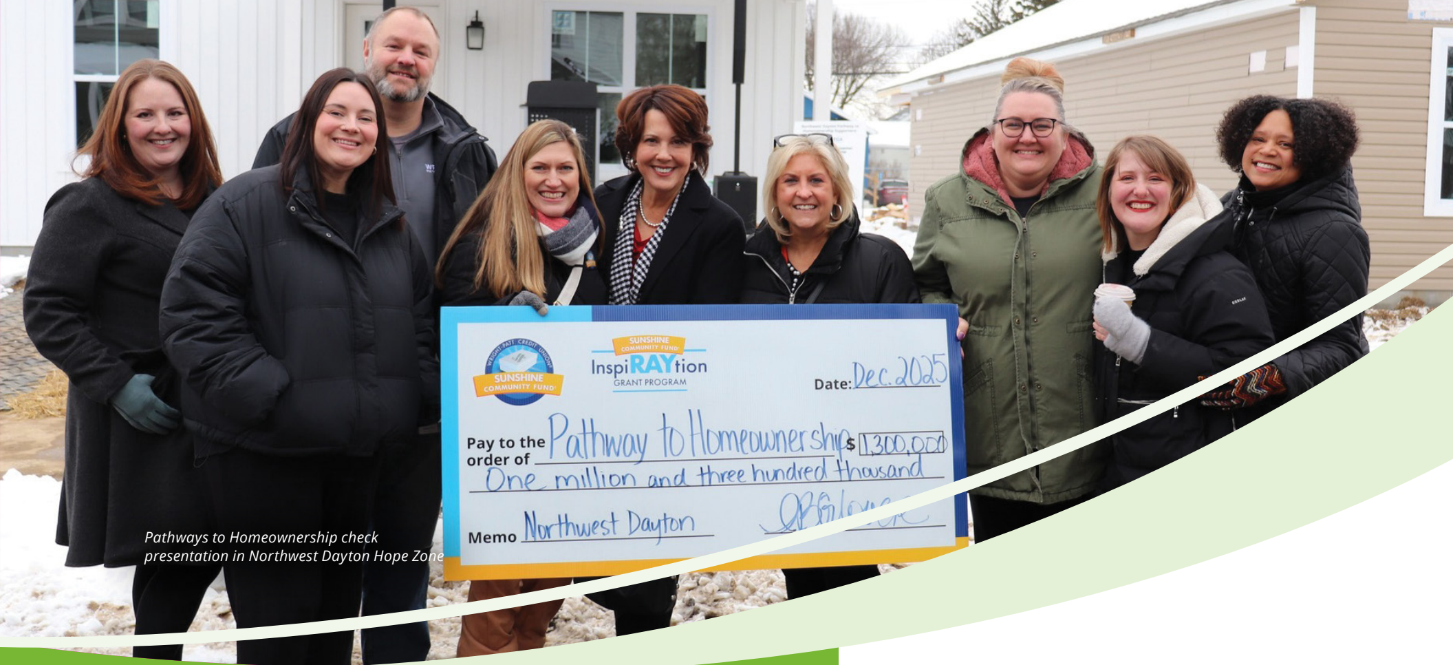
Pathways to Homeownership check presentation in Northwest Dayton Hope Zone