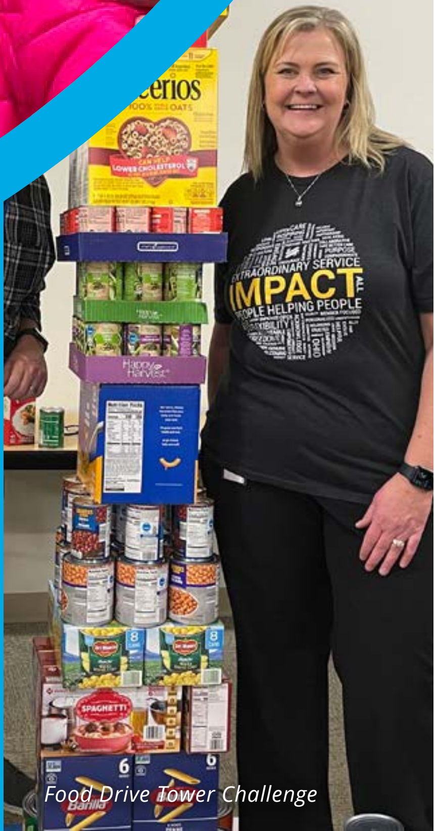
Food Drive Tower Challenge

Our vision is to be a trusted strategic partner for transforming the financial well-being of the communities we serve.