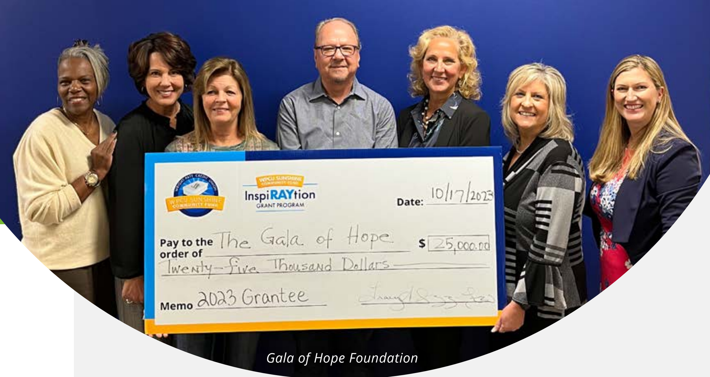
Gala of Hope Foundation